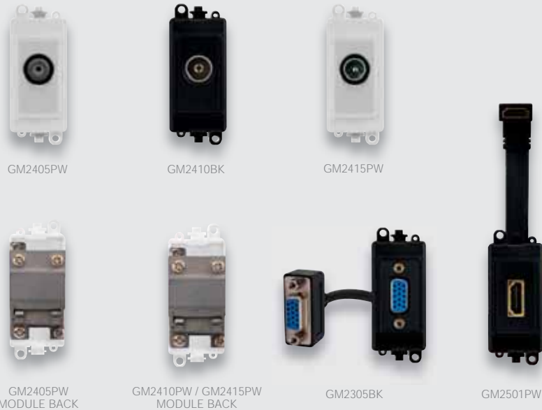
GM2305/ GM2405/ GM2410/ GM2501