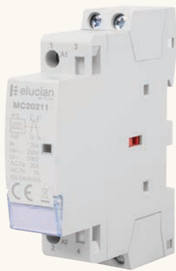
*MC20211 example shown.