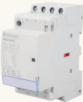
*MC25422 example shown.